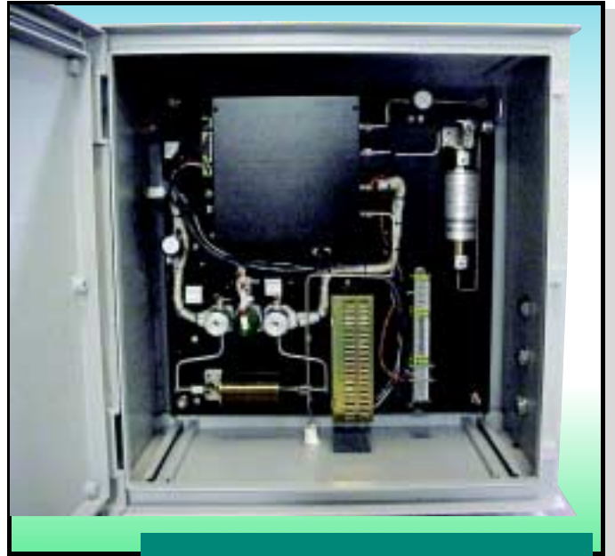
Model 3050-DO for Dryer Outlet Monitoring

Today, because of these advantages, quartz-crystal-based moisture analyzers are the fastest growing line of moisture analyzers in the world.