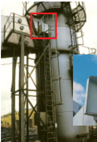
Typical ChillerProbe™ installation

ChillerProbe™ - an effective and efficient sampling method for even the most demanding applications