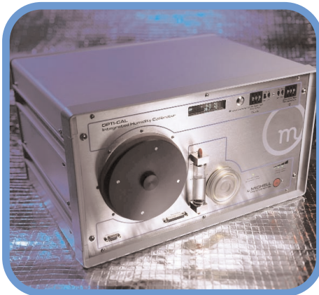
Opti-Cal Humidity Calibrator

Stand-alone calibrator for rh sensors providing humidity and temperature profiling with an in-built, traceable cooled mirror reference hygrometer