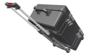
Also available with trolley (optional)